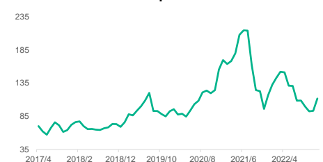
Iron Ore 62% Fe - USD per metric ton

In addition to the financing structure and discount rate, there are other pieces in our valuation model that can have a large impact on the value for current equity holders. One of these factors is the Iron Ore price. Considering that high-quality >67% Fe concentrate will be essential to facilitate the green transition, while only ~4% of global iron ore production is of >67% Fe grade, this will command a price premium compared to 62% and 65% Fe grade. And with the high-grade iron ore market segment expected to grow at an 8% CAGR, from 110Mt today to 750Mt in 2050, this premium is likely to expand in future.